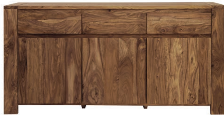
Aaliyah 3 Door /3 Drawer Sideboard H 800 W 1600 D 450