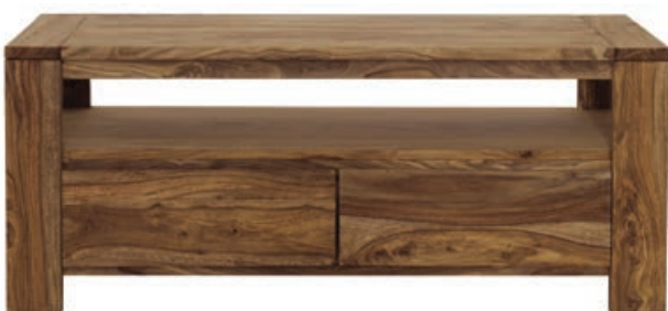
Aaliyah Media unit H 500 W 1200 D 400