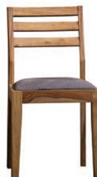
Aaliyah Chair H 990 W 460 D 490