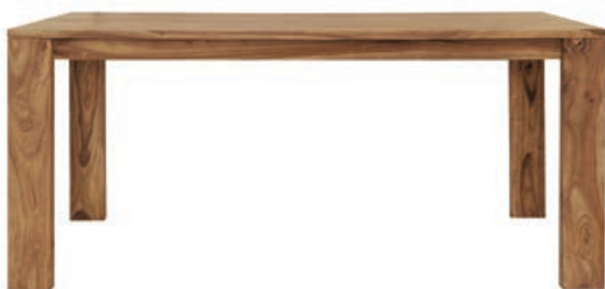
Samara Dining Table H 760 W 1800 D 900