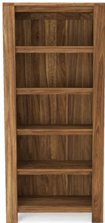
Aaliyah Bookcase H 1850 W 900 D 400