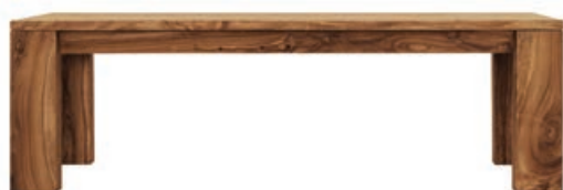
Aaliyah Dining Bench H 450 W 1550 D 400