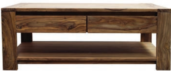
Aaliyah Coffee Table H 400 W 1200 D 600