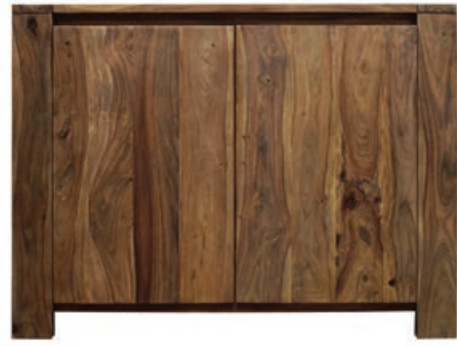
Aaliyah Hallway Cupboard H 850 W 1030 D 450