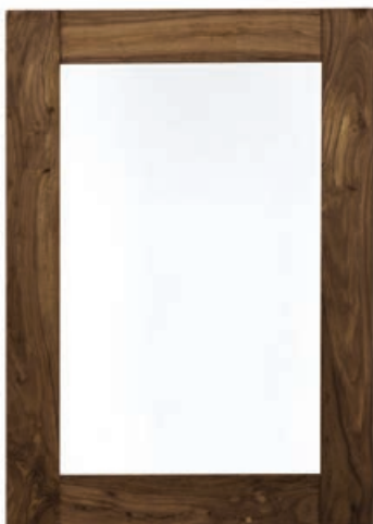
Aaliyah Mirror H 1000 W 700 D 30