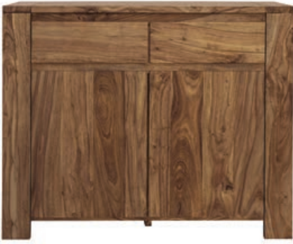
Aaliyah 2 Door 2 Drawer Sideboard H 850 W 1030 D 450