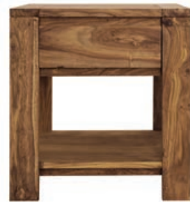
Samara Side Table H 550 W 500 D 500